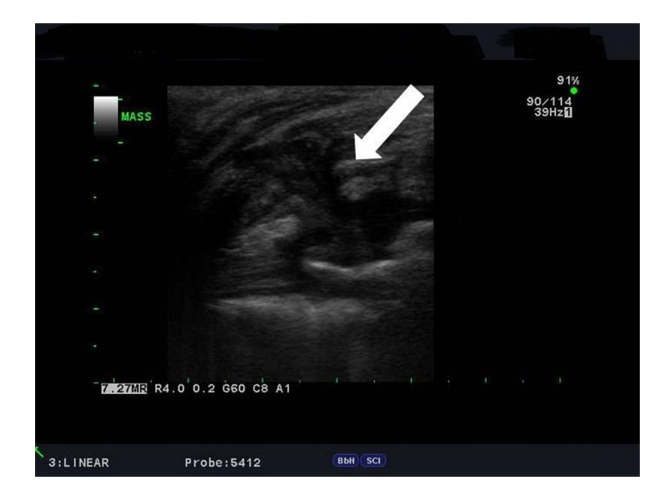
Fig 3. Perforation of the stomach is detected on ultrasonography (white arrow).