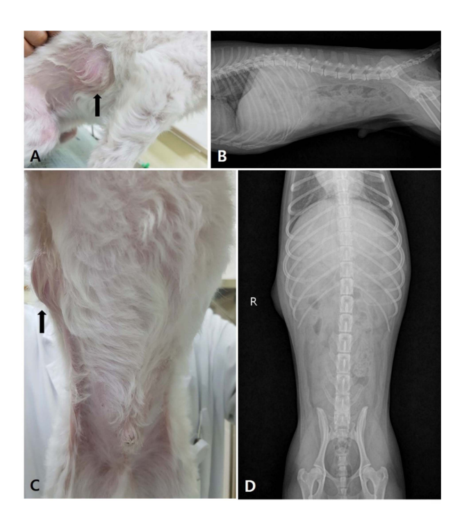
Fig 1. Clinical appearances and radiograph images. Hard subcutaneous mass on left flank area (A) and (C) and lateral (B) and ventral (D) views on radiography. Black arrows show subcutaneous mass.

Radiography was used to rule out the presence of a foreign body before assessing the mass in this case, but no remarkable findings were observed, except for the mass. The mass was hard and firm on the right rib and a bone tumor was suspected. Because osteosarcoma accounts for 85% to 98% of all bone tumors and is highly aggressive, biopsy should be planned and performed promptly. During punch biopsy, an ice cream stick ( 11.5 \times 1.2 cm) unexpectedly appeared from the cutting hole of the mass. The mass appeared owing to the ice cream stick pushing against the abdomen. On physical examination, severe hypertension was observed and it was thought to be induced by pain because of the presence of the foreign body. On histopathology, marked, diffuse, neutrophilic, and mild eosinophilic dermatitis/cellulitis was observed.