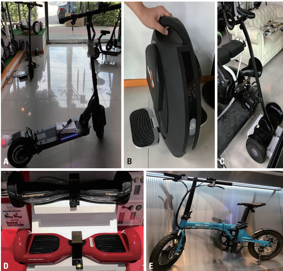
Fig. 1. Pictures of the personal mobility. (A) Electric scooter, a stand-up scooter with a small platform with two wheels driven by an electric motor. (B) Electric unicycle, a single-rider electrically powered unicycle. (C) Self-balancing scooter with handle. (D) Self-balancing scooter with no handle (hoverboard), a self-balancing powered vehicle with two parallel wheels, where the rider's foot position or the sensor in handle causes the vehicle to move. (E) Electric bicycle, a bicycle propelled in part or solely by rechargeable electric batteries.

We performed a retrospective 2-year observational study,