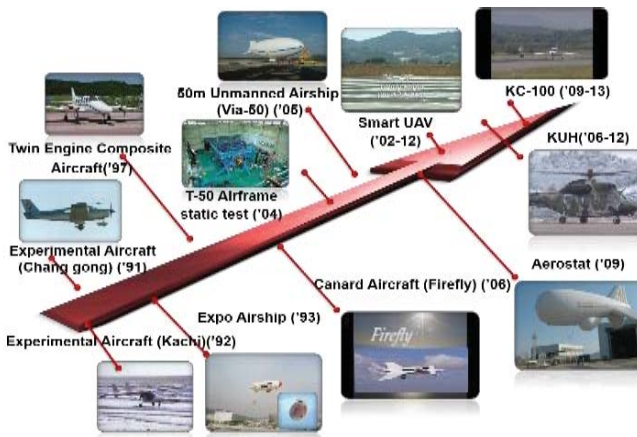
Fig. 2 Major R&D Outcome of Korea Aerospace Research Institute [6]

The Korea Aerospace Research Institute is a developer of Experimental Aircraft Kachi(1993.4),