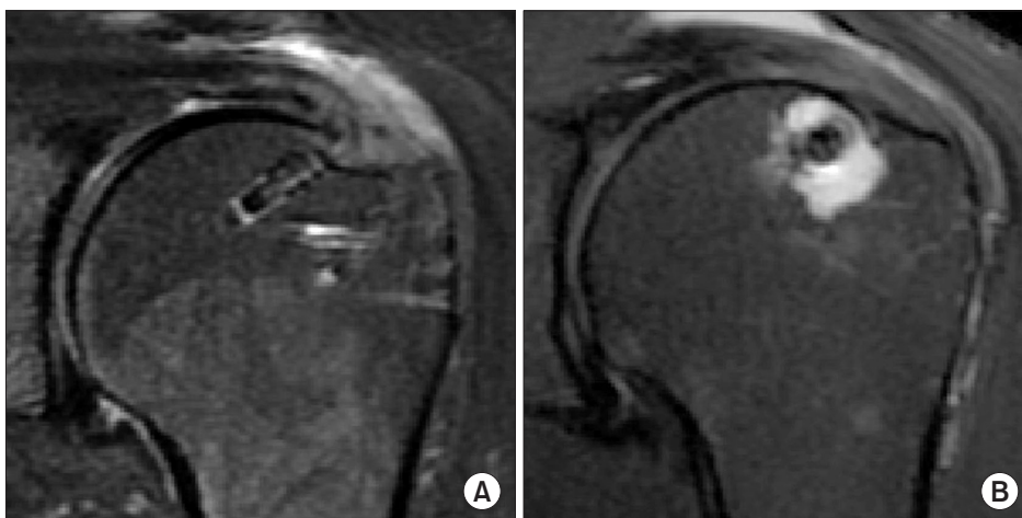
Fig. 4. Typical cases illustrating (A) without perianchor cyst formation (grade 0), and (B) with severe perianchor cyst formation (grade 4).