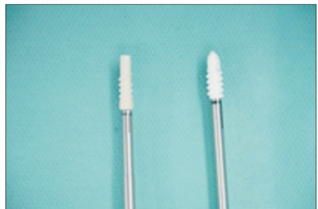
Fig. 1. Healix BR TM anchor (left; DePuy Mitek, Raynham, MA, USA) and Fixone anchor B (right; Aju Medical, Seoul, Korea).

Finally, 78 patients (40 men, 38 women) with an average age of 61.3 \pm 6.9 years (range, 45–75 years) were enrolled. The patients who fulfilled the inclusion criteria were divided into two series, based on the period in which they were treated. The first series consisted of patients who underwent surgery between December 2013 and November 2015 (n=38), and the second series were treated between December 2015 and September 2016 (n=40). For the first 38 consecutive patients, we used the