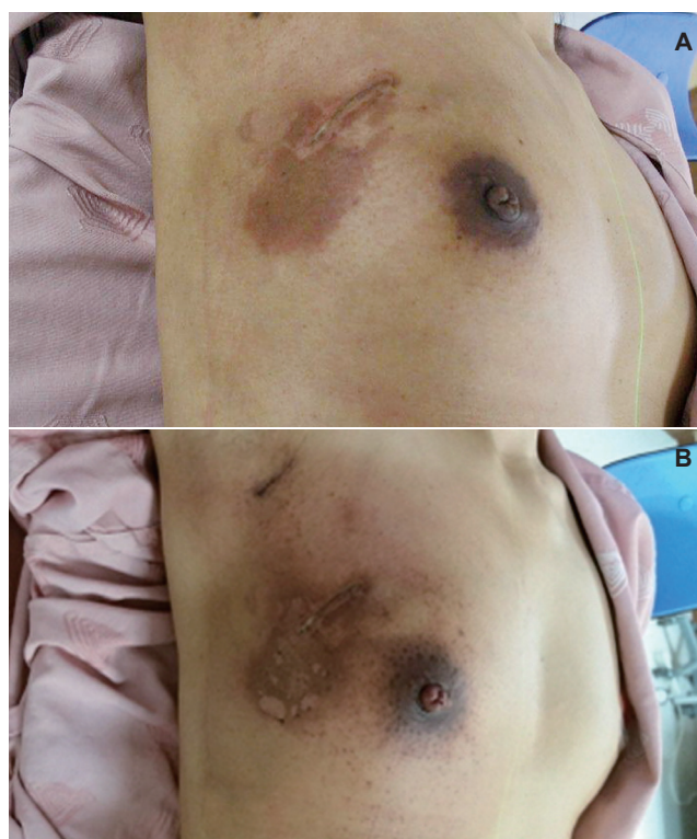
Fig. 3. Patient with maximum dose of 8.42 Gy developed skin toxicity during external beam radiation therapy (EBRT). Photographs were taken (A) after 14 fractions of EBRT and (B) immediately after the completion of EBRT.

Thirty-eight patients had a maximum skin dose larger than 2 Gy, while 17 patients had a maximum skin dose larger than 3 Gy. Median and mean skin dose were 2.26 Gy (range, 1.03 to 8.42 Gy) and 2.68 Gy. The inflection point of the maximum skin dose among the 55 patients was located between 2 Gy and 3 Gy. Therefore, patients recording maximum skin dose higher than 3 Gy can be regarded as larger than average group. ROC