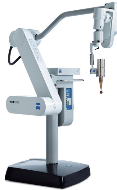
Fig. 1. Intraoperative radiotherapy device.

The primary endpoint was to provide an independent assessment of the delivered dose and consistency of the IORT technique through optically stimulated luminescent dosimeter (OSLD)-based in vivo dosimetry. The secondary endpoint was to determine clinical factors associated with increased risk of delivering a higher skin dose than intended. The phase 2 trial allowed enrollment of patients with histologically proven breast cancer undergoing BCS, aged 20 years or older, and with maximum tumor size less than 5 cm and Eastern Cooperative Oncology Group (ECOG) performance status of 1 or 2, but excluded patients who received neoadjuvant chemotherapy prior to BCS, or who required surgery for bilateral breast cancer. The study protocol conforms to the ethical guidelines of the 1975 Declaration of Helsinki, and was approved by Gangnam Severance Hospital Institutional Review Board (No. 3-2013-0299). All subjects provided informed consent prior to