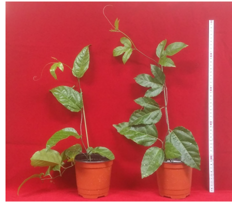
Fig. 3 Acclimatized regenerated plants after 4 months of transfer from in vitro culture

Nowadays silver nitrate has been used widely as an efficient antioxidant for overcoming explant browning in a