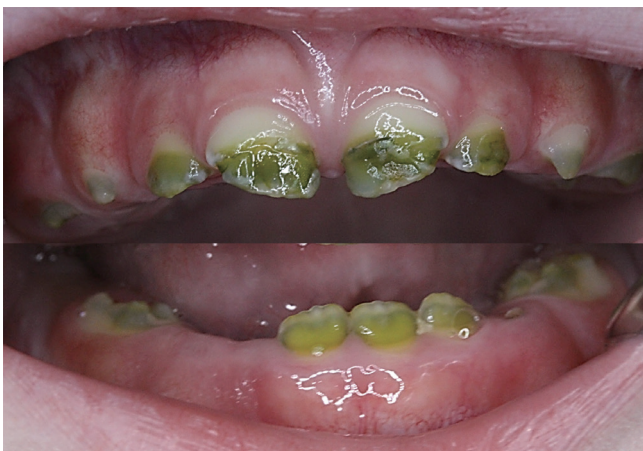
Fig. 2. Green discoloration of teeth at 3 months after the first visit.

Owing to chorioamnionitis, the patient was born prematurely after 25 weeks and 6 days of gestation, weighing only 750 g. The patient received intubation in an incubator due to perinatal asphyxia. At birth the patient suffered from a neonatal seizure and was diagnosed with periventricular leukomalacia and cerebral palsy. The patient also received phototherapy for 1 week, due to neonatal hyperbilirubinemia.