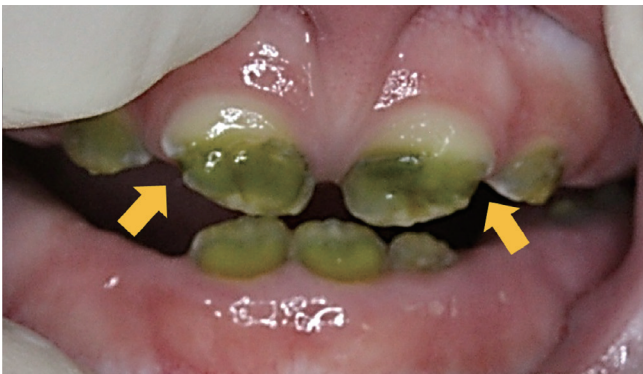
Fig. 1. Green discoloration of teeth in a 22-month-old boy. Enamel hypoplasia was evident on the primary upper central incisors (yellow arrows).

A 22-month old male visited the Department of Pediatric Dentistry, Yonsei University Dental Hospital due to tooth discoloration. A clinical oral examination revealed that the primary central and lateral incisors (with the exception of the lower right lateral incisor) were erupted, and that the primary lower first molars were partially erupted. These teeth showed green discoloration, and the upper central teeth exhibited enamel hypoplasia (Fig. 1).