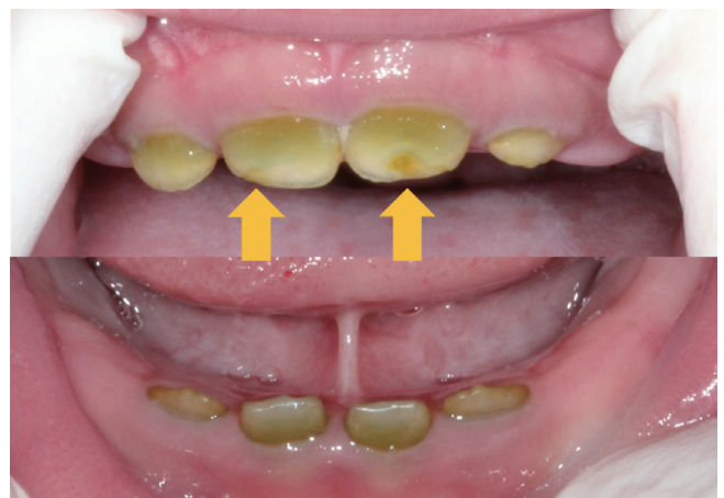
Fig. 3. Green discoloration on the primary upper and lower incisors in a 16-month-old boy. Upper central incisors showed enamel hypoplasia (yellow arrow).

The patient was born by Cesarean section due to an amnion rupture after 26 weeks and 6 days of gestation, weighing 930 g. The patient suffered from severe bronchial pulmonary dysplasia. The patient received ligation of patent ductus arteriosus