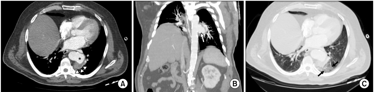
Fig. 1. Contrast-enhanced multidetector computed tomography showing (A) a saccular aneurysm (asterisk) and perianeurysmal atelectasis (arrowheads), (B) favorable position of the aneurysm in reformatted coronal oblique multiplanar reconstruction (arrow), and (C) the presence of ground-glass opacities (arrows).