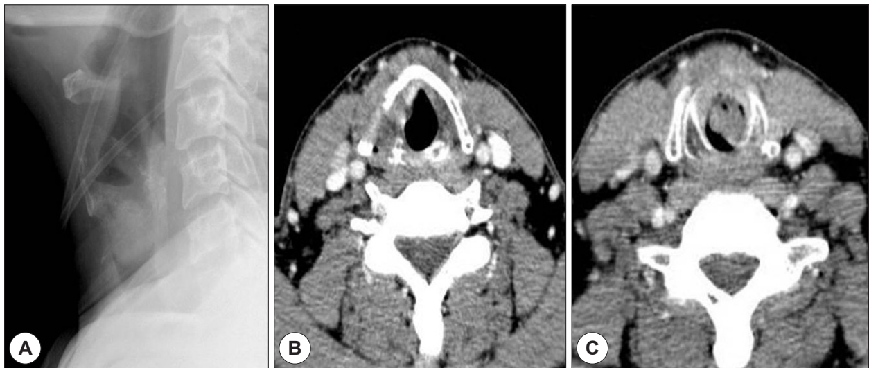
Figure 1. Neck lateral X-ray shows the large mass at the subglottic space (A). Axial CT scan at the level of the glottis (B) and subglottis (C) shows the large mass that nearly obstructed the airway lumen on the subglottic area.

Vocal polyp occurs along the membranous vocal folds and usually located at the mid portion of the membranous vocal fold. Generally ,vocal polyp usually presents as an exophytic