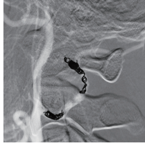
Fig. 4. Angiogram showing the afferent feeding vessel and pseudoaneurysm treated with endovascular coil embolization.

Tae Gon Kim http://orcid.org/0000-0002-6738-4630 Kyu-Jin Chung http://orcid.org/0000-0001-6335-1818 Jun Ho Lee http://orcid.org/0000-0002-0062-6420 Yong-Ha Kim http://orcid.org/0000-0002-1804-9086