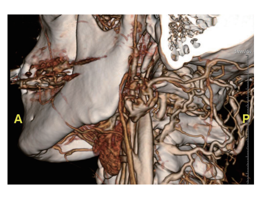
Fig. 3. Computed tomographic angiogram showing the pseudoaneurysm along the course of the proximal occipital artery. A, anterior; P, posterior.

infections or a genetic disorder [3]. There have been no previous reports of a spontaneous pseudoaneurysm of the occipital artery presenting as a neck mass. The diagnosis can be made based on a thorough history, the exclusion of other possibilities, and imaging studies. Currently, computed tomography angiography is regarded as the most definitive noninvasive diagnostic tool. The advantages of treatment include a reduced risk of hemorrhage, pain relief, and alleviation of cosmetic disfigurement. Treatment options include surgical excision, ligation of the feeding artery, trapping of the pseudoaneurysm, and endovascular arterial embolization and coil occlusion [3].