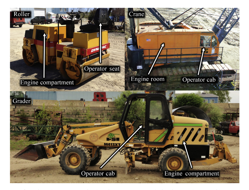
Fig. 1. The engine compartment location relevant to operator seat in three heavy-equipment machines.

The research team evaluated several types of SDMats based on their advertised noise dampening level, the frequencies of maximum attenuation, flexibility, ease of installation, thickness, and heat-resistance capability. SDMats are advertised under different names such as noise barrier material, sound deadening, and noise barrier composites. The SDMats selected for this study were manufactured by Technicon Acoustics (Concord, NC, USA) and sold by West Marine (Watsonville, CA, USA) under the name WEST MARINE Noise Control Barrier Material for use in boats to reduce engine compartment noise levels. This mat has some deadening (vibration reduction) capability but it was primarily a sound absorbing material, with its highest attenuation in the 1.000–4.000 Hz range. These SDMats were made of two lavers of open-cell polyurethane foam separated by high-density polyvinyl chloride vinyl flexible sheet. The inner side of the SDMats was coated with an adhesive layer that could be attached to a metal surface. The exterior layer was covered with thin film of Mylar reinforced with elastomer-coated fiberglass providing additional surface heat protection, resulting in the material being fire retardant up to 107.2°C (225°F). West Marine sold the SDMats in 81 cm \times 114 cm (32 in \times 45 in.) rolls with either 1.3 cm (0.5 in.) or 2.5 cm (1 in.) thickness.