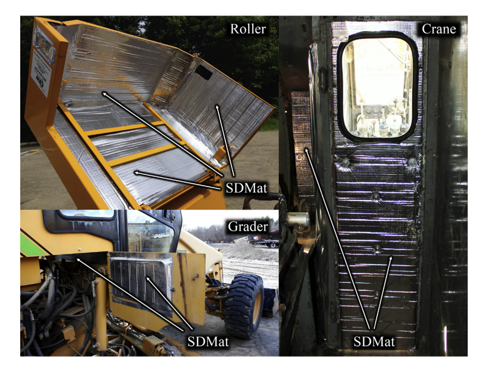
Fig. 2. Grader and roller engine compartments with sound dampening mats (SDMats) installed. In addition, crane engine room with SDMats installed on the door leading to operator cab.

For each piece of heavy equipment, four sets of SPL measurements were collected on four different settings: idle preintervention, idle postintervention, full-throttle preintervention, and full-throttle postintervention. The data from all tests are stationary and autocorrelated with a lag of 1. The autocorrelationadjusted standard error, which increased by 20–30%, was used in