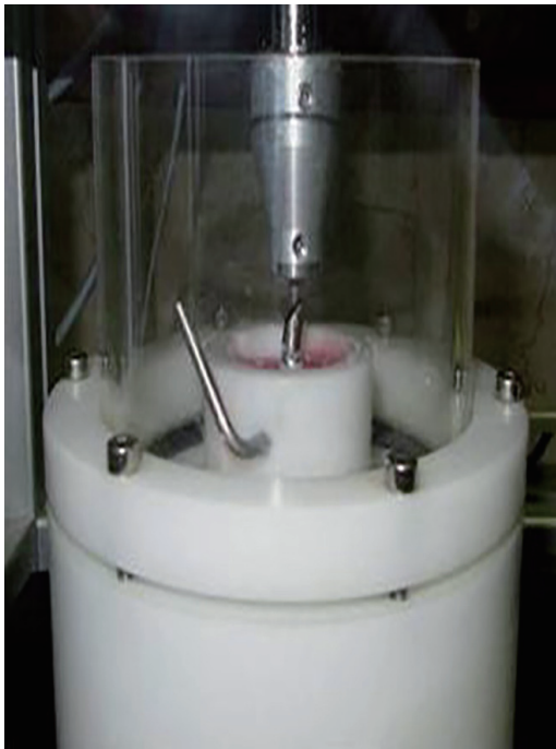
Fig. 2. The forces are applied in 45-degree angle over the crowns.