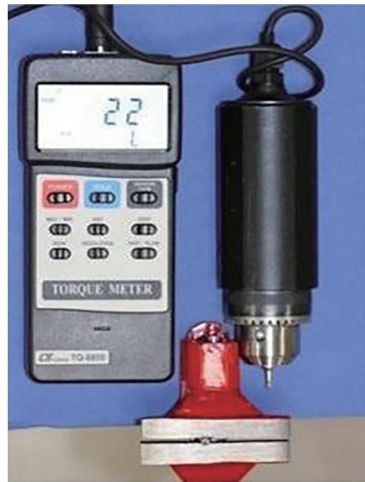
Fig. 1. Digital torque meter is used to reach reproducible and accurate forces.

Quantitative variable of the results in both groups was calculated as mean and standard deviation with SPSS for Windows (Version 16.0, SPSS Inc., Chicago, IL, USA). To analyze the effect of applying cyclic loading on specimens and using adhesive material on detorque value, 2-way analysis of variance (2-way ANOVA) was used. The value less than 0.05 was considered statistically significant difference ( P < .05 ).