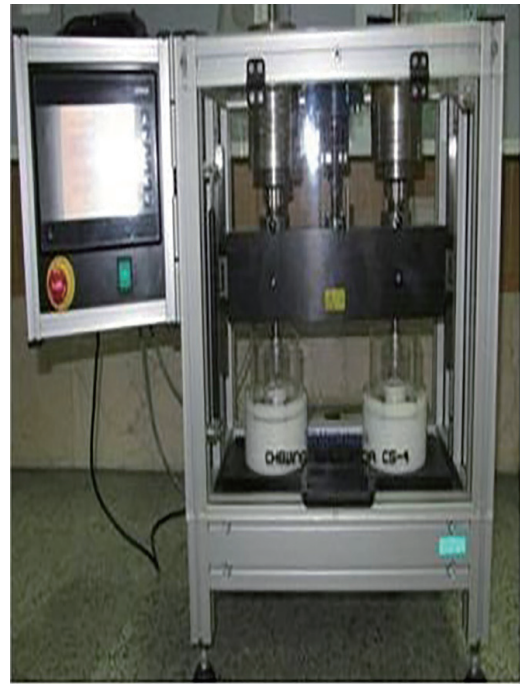
Fig. 3. Cyclic loading was applied to imitate the oral condition.