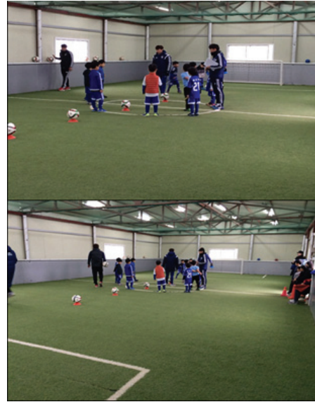
Fig. 2. Observational research at a children's soccer class

At the Children's Living Guidance Institute, we observed an indoor dance routine class and outdoor play class for 18 six-year-old girls and boys. During the soccer class, we observed the basic physical ability training and a simulated soccer match for 22 children, including one girl. The children's exercise activities and characteristics were recorded (Fig. 2).