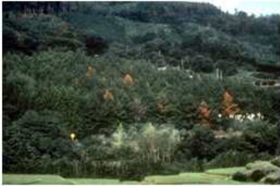
그림 1. 재선충에 피해입은 수목(일본) Figure 1. Scattered trees of Pinus thunbergii in Japan, killed by B. xylophilus

one month. The infected trees then die. If the infection time by the pine wilt disease pest/insect is delayed or if only a small amount of such pests/insects infiltrate a pine tree, the symptoms will start to appear at a later time. That is, the infected tree will wither to death in the following year, or in some cases, only some branches will die.