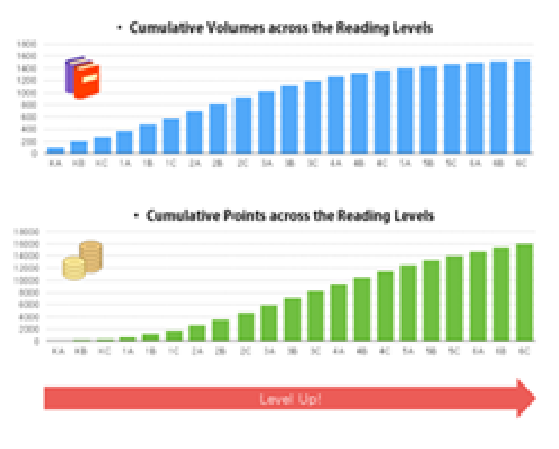
Fig. 2. Online Level-up System

To illustrate the online level-up system, students normally need to read 100 books for their level up. As the following table shows, a point is given when a reader has passed the current course after reading a book. The point value is set for each book and marked on the cover of the book. The point value is determined based on the level of the book, word counts, and other variables of grading books.