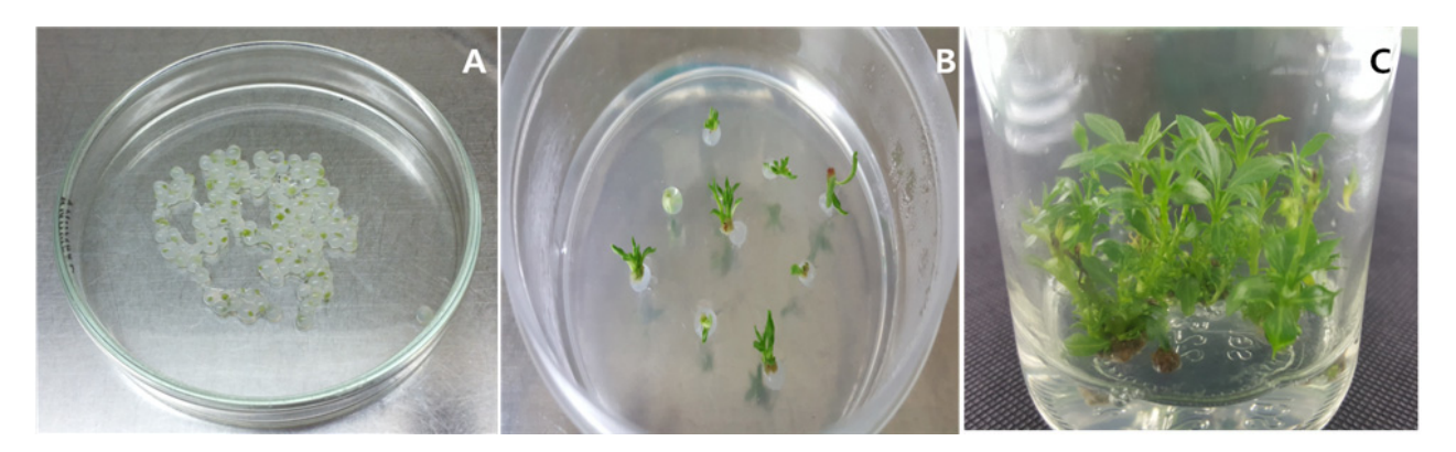
Fig. 3. Cryopreservation of pear shoot tips using encapsulation-dehydration. (A) Encapsulation of pear shoot tips grown in vitro using sodium alginate. (B) Regeneration of pear shoot tips 8 weeks after cryopreservation. (C) In vitro proliferation of pear regenerants from cryopreserved tissues.

<sup>z</sup>Means within columns followed by the same letter do not differ significantly at the 5% level.