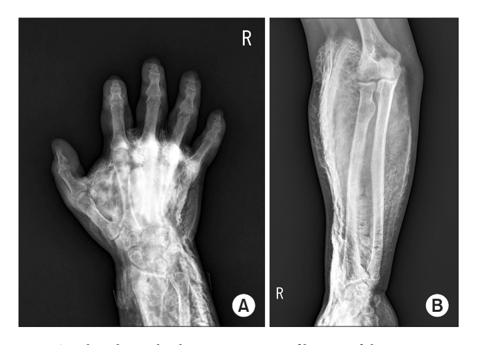
Fig. 2. Simple radiographs showing extensive infiltration of the contrast media stretching from the hand (A) to the elbow (B) after computed tomography.

The patient complained of the pain to the radiologist soon after the injection, but the patient was discharged after being advised that the pain would be temporary. In AM 10, the initial pain in the right hand and wrist became severe after time, leading to swelling and redness in the forearm. In AM 11, she visited the dermatologic department and consulted to the orthopedic department because of these symptoms. In PM 2:30, the patient was suspected of having compartment syndrome induced by extravasation of the contrast media and was sent to the emergency room immediately. The patient presented with unstable vital signs: blood pressure of 174/127 mmHg, a heart rate of 120 beats/min, and a body temperature of 37.2°C. Physical examination showed multiple bullae formation on the dorsum of the right hand and wrist; swelling and redness from the hand to the distal forearm; and severe pain during finger extension (Fig. 1). Simple radiograph showed the contrast media extravasation that expanded from the right hand to the distal upperarm (Fig. 2).