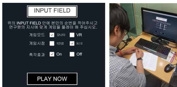
Fig. 3. An option screen for setting each independent variable in the experimental environment (left) and an evaluation test for each condition (right)