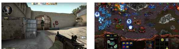
Fig. 1. First-person viewpoint, 'Counter-Strike'(left) and third-person viewpoint, 'Starcraft'(right)

Most of the virtual reality games currently on the market are first-person viewers. The immersion can be measured by the immersion into the complete game environment and the lack of awareness or escape of the real space. In the case of VR devices using HMD (Head Mounted Display), audiovisual information of the real world is blocked and audiovisual information of the virtual world is presented, leading to high immersion [5]. It is natural that the first-person viewpoint is a content of the virtual space, since the viewpoint of the game character coincides with the viewpoint of the user and the visual and auditory information in the game is limited within the visual range of the character [6].