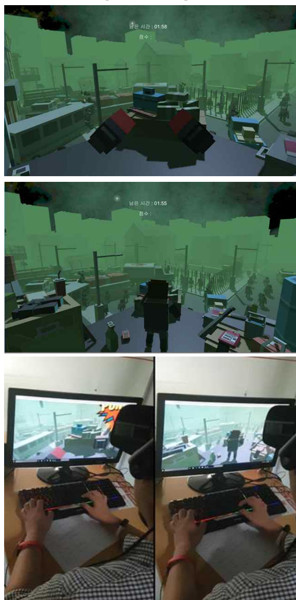
Fig. 4. Scenes of playing virtual environment game at different points of view as an independent variable

In the case of the game viewpoint, the third-person is directed by the camera that illuminates the game screen and looks down from the back of the play character. In the first-person, the camera is placed at the eye position of the character and glove only the fist which was put on was seen. The position of the camera is changed only when the difference between the viewpoints (first-person, third-person), and both the monitor and the HMD are fixed to the same place if the viewpoint is the same.