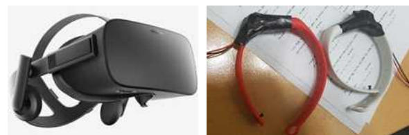
Fig. 2. Oculus Rift device (left) and vibration wrist band (right) for the experimental settings

In the experiment, we evaluated the immersion, fun, and presence of the game as the dependent variables for three independent variables (game viewpoint: first-person vs. third-person, display method: monitor vs. VR display, vibration feedback: haptic vs. no haptic), respectively. In the general environment of the monitor, not the virtual reality, the research design (2x2x2) was added to the display method to confirm the effect of the game viewpoint (first-person or third-person viewpoint).