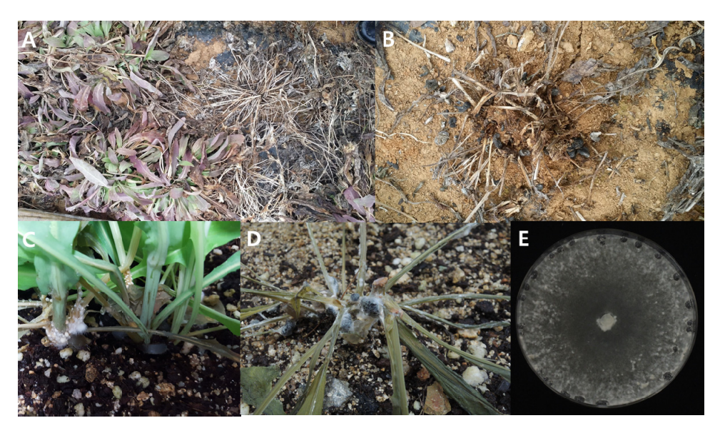
Fig. 1. Symptom of sclerotinia rot on Ixeridium dentatum caused by Sclerotinia sclerotiorum and culture features. A, B, Infected plants; C, D, Symptoms induced by artificial inoculation; E, Mycelial mat and sclerotia produced on potato dextrose agar after 10 days at 20°C.

agent of sclerotinia rot on Ixeridium dentatum , based on morphological features, sequence analysis of the internal transcribed spacer (ITS) region and pathogenicity test.