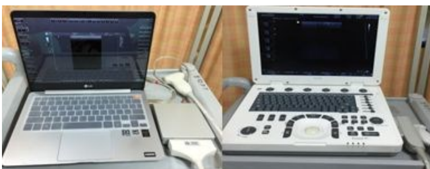
Figure 1. (A) Personal computer-based muscle viewer and (B) portable ultrasound.

The participants assumed two positions in rest and contraction for the measurement of the UT muscle thickness. For the resting position, the participants were sat upright in a neutral position with the head straight-; the dominant side was measured. For contraction, the participants held the arm at 30^\circ abduction for 10 seconds [21]. In the two positions, the participants were asked to fully extend the elbow and a goniometer was used for the maintenance of the arm's abduction angle. To determine the transducer placement, the examiners drew lines with a kohl pencil from the mid-line between C6 and the angle of the acromion. The probe was placed parallel to the muscle fibers, and the examiners asked