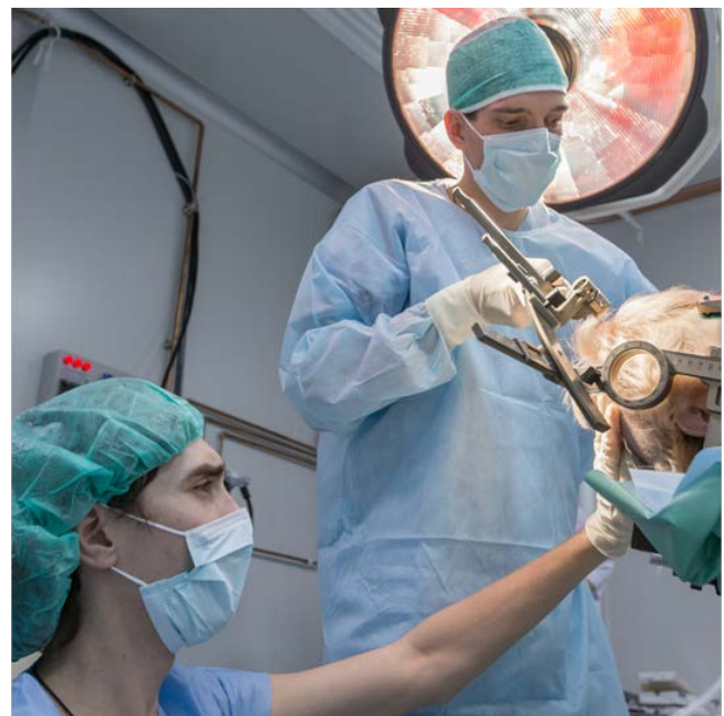
Fig. 2. Stereotactic brain tumor biopsy.