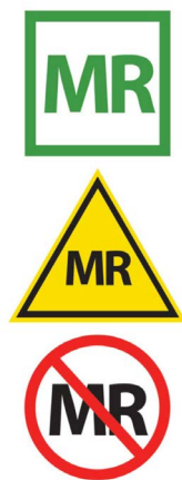
Fig. 4. Color marks for equipment.

White et al. (8) suggest not only to use checklists in daily practice, but to appoint a special person (usually radiologist) - Procedure Safety Officer - to control the safety protocol realization and to make records with SSCL. Soroka et al. (13) also offer to appoint a physician as a manager, who will be responsible for the processes monitoring on the regular basis (or for the concrete operation). Childs and Bruch (14), based on their intraoperative MRI experience, specified some important points - the detailed preparation