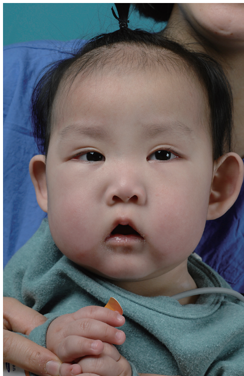
Fig. 2. Twenty-month-old girl with Kabuki syndrome. She underwent two-flap palatoplasty for incomplete cleft palate.

Cardiovascular anomalies are known to affect approximately 50% of the patients with Kabuki syndrome [4]. In contrast, a notable finding in this series is that every patient has a history of congenital cardiac defects with varying severity from a simple atrial septal defect that does not necessitate surgical