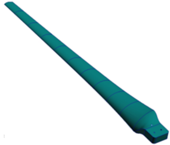
Fig. 1 Designed aerodynamic configuration of blade

An in-house aerodynamic design program based on the theoretical equation above is newly coded. If the wind speed and design parameters are given as an input data, the program can calculate the tip speed ratio, power coefficient and power considering Reynold's number. Here the look-up table of the local Reynold's number of each airfoil is obtained by the CFD analysis. The final aerodynamic configuration is shown in Fig. 1.