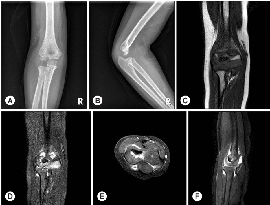
Fig. 1. Initial radiographic examination of the 5-year-old male patient. (A, B) Sclerosis within the capitellar ossification center is seen on this anteroposterior and lateral plain radiographs. (C, D) A T1-weighted and a T2-weighted fat suppressed coronal image show a dark signal throughout the capitellum. (E, F) A T1-weighted fat suppressed axial and a T2-weighted fat suppressed sagittal images show decreased signal throughout the capitellum. The overlying articular cartilage appears intact with smooth articular surface.