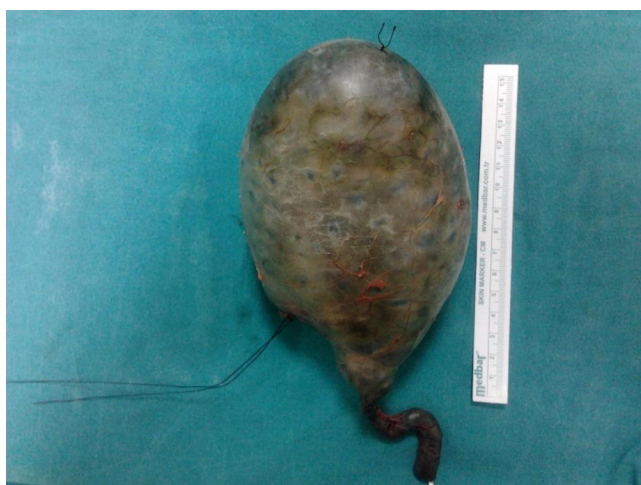
Fig. 2. Macroscopic appearance of the choledochal cyst (>16 cm).

to pelvic region. There was minimal dilatation at intrahepatic bile ducts. Bilateral ovaries, kidneys, and pancreas were normal. It was suspected that bile duct's dilatation was due to abdominal giant cyst's pressure. Abdominal CT findings were consistent with US (Fig. 1). She was operated with the differential diagnosis of duplication, omental or mesenteric cyst. At operation, a giant type 1a choledochal cyst, 160 mm in diameter, was surprisingly detected (Fig. 2). Roux-en Y hepaticojejunostomy procedure was performed. Serum levels of bilirubin decreased sharply and the patient was discharged without any problems on the tenth postoperative day.