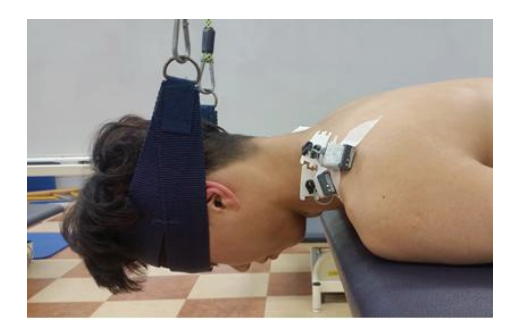
Fig. 3. Measurement position

(1) Scalenus anterior and sternocleidomastoid muscle For the scalenus anterior, an electrode was attached to the triangular point formed by the back of the sternocleidomastoid muscle, above the clavicle and the upper trapezius. For the sternocleidomastoid muscle, an electrode was attached to the middle point of the mastoid and the upper notch in the sternum (O'Leary et al., 2011). The subjects were in a prone position, and the tool was placed near their forehead. With Halvorsen (2010) method, subjects contracted for 10 seconds isometrically with chin-tuck (Fig. 3). In a repeated measurement three times,