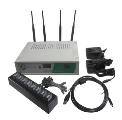
Fig. 2. Electromyogram measurement tool

rectification of the collected muscle activity signal during cranio-cervical flexion and extension using the Acquisition and Analysis Software (Delsys, U.S.A.) program, and it was quantified to maximal voluntary isometric contraction (MVIC).