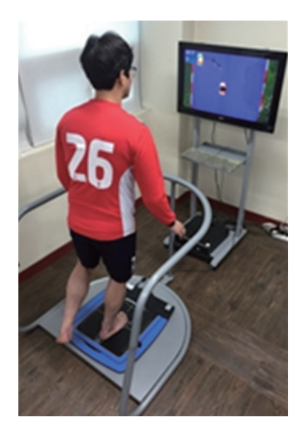
Figure 1. Ankle stabilization training using biofeedback.

tical information, and it offers biofeedback during training (Figure 2). Training is proceeded with six games, and the games were carried out while standing with one leg in the middle of the force plate. The training lasted for thirty minutes with a one-minute break and four minutes training per game. The control group went through thirty minutes of treadmill training (thirty minutes of training was given to the control group) with no additional rest.