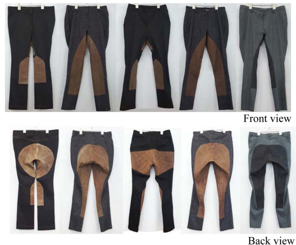
Photo 2. Design development and productions.

generated by irritating knee by sewing line due to slim margin between patch part, which is inside reinforcement plate, and outside plate, irritation of knee by slim margin of cutting line can be avoided if cutting line of patch part shall be composed of diagonal line from crotch to the middle of front knee. It can reduce irritation to skin by processing slim margin toward outside with flat fell seam instead of simple over lock process or doing stitching one more time by pushing slim margin to the maximum. Second, since lower