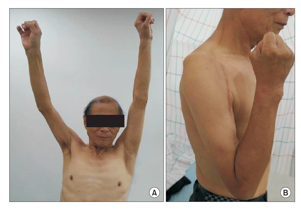
Fig. 2. Clinical photogragh at follow-up 6 months postoperatively. (A) The patient showed 140° of the active elevation of the operative shoulder. (B) The patient showed the resolution of the musculocutaneous nerve palsy completely without any effect on the functional outcome.

capsule were reattached to the lesser tuberosity of the humerus.