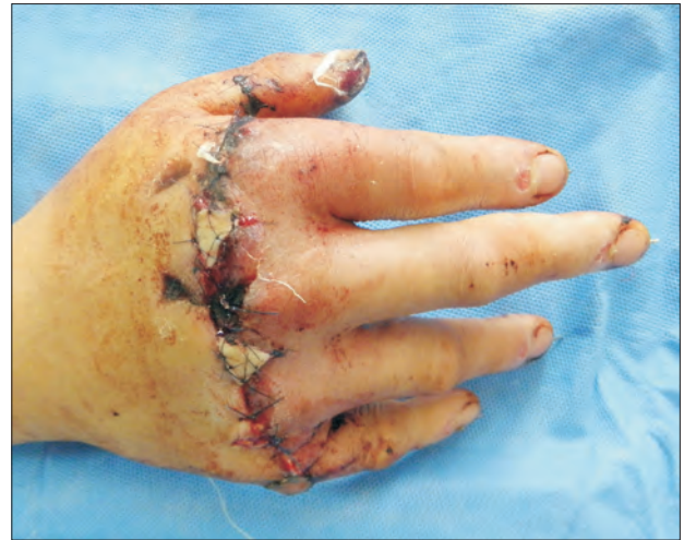
Fig. 3. At postoperative day 2, the full thickness skin graft was done on hand dorsum.