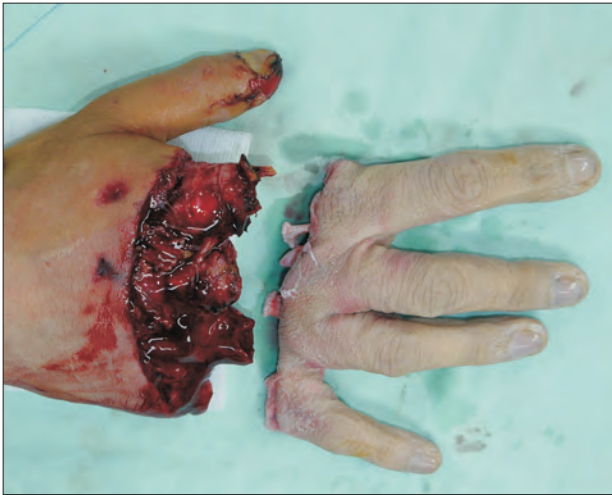
Fig. 1. A 33-year-old male with complete amputation of the all four fingers of left hand.