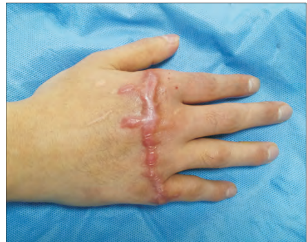
Fig. 4. Three months after replantation, the patient's hand shows complete viability.

tension free venous anastomoses. So we closed the wound first. After checking circulation of the hand, we made additional incisions on the web space where dorsal veins were expected to be present and performed the venous anastomoses using the dorsal metacarpal and digital veins. We mobilized the veins proximally before anastomoses to relieve tension over repair site and conducted anastomoses of total five veins. After completion of venous anastomoses, we attempted to suture the skin over venous anastomoses site. But due to surgical site tension, which was producing compression over the anastomosed veins, full thickness skin graft were applied over the five venous anastomoses sites harvested from the ipsilateral forearm (Fig.