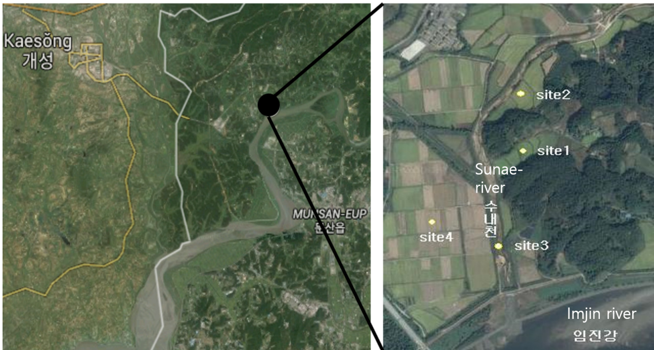
Fig. 1. Location of the study area (left) and its zoomed-in view(right).

to cross the levee to reach Site 4. Secondly, an irrigation canal runs near the paddies, and water accordingly was provided in a stable manner regardless of the weather condition. In contrast, drought affected Sites 1–3 at some point in time.