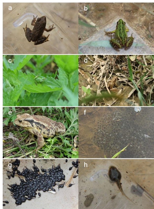
Zone. a= Glandirana rugosa ; b= Pelophylax nigromaculatus ; c= Hyla japonica ; d= Rana coreana ; e= Bufo gargarizans ; f= egg mass; g= smaller tadpoles; h= mature tadpole

The second-most frequently observed frog ( Hyla japonica ) was mostly found in Sites 1 and 2, where they can protect themselves from predators with their green color similar to that of the plants surrounding them (Fig. 3). It is possible that this is due to the fact that Hyla japonica is a tree frog, and prefers heavy foliage to large bodies of water. During the field research, they were first observed in May in Sites 1 and 2. Since then, we could not find