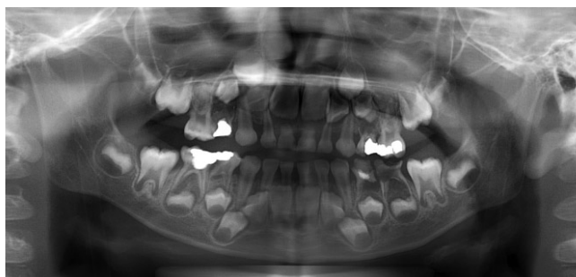
Fig. 1. Initial panoramic radiograph. Radiographic examination revealed dental caries, periapical abscesses, and folliculitis. Dental caries were on the maxillary right primary first and second molar, maxillary left primary first molar, mandibular right and left primary first and second molars. And folliculitis was observed on the permanent maxillary right and left first premolars and on the permanent mandibular left first and second premolars.

Six months later, both permanent mandibular first molars were fully erupted (Fig. 3, Fig. 4). The denture fitted poorly after physiologic exfoliation of the mandibular primary incisors. Thus, a lingual arch with artificial teeth was used to recover masticatory function and preserve space for the successors (Fig. 5).