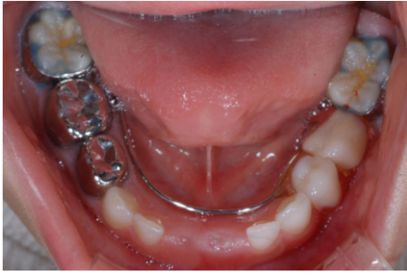
Fig. 5. Intraoral photograph after insertion of a lingual arch with artificial teeth.