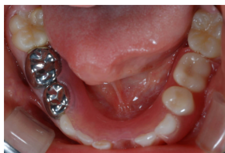
Fig. 3. Periodic intraoral photograph 6 months after insertion of the denture.