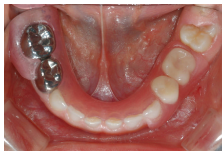
Fig. 2. Intraoral photograph after insertion of a flexible denture.