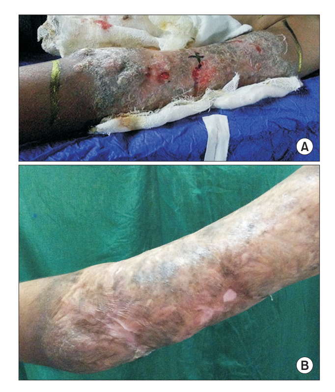
Fig. 1. (A) Pre-treatment photograph showing involvement of the entire circumference of the arm with extensive ulcero-nodular skin lesions with diffuse scaling, bleeding and crust formation. (B) Post-treatment photograph showing complete resolution of the skin lesions.

as a small nodule first noticed by him about 6 years ago and recurred despite repeated excisions, each recurrence being more extensive and aggressive than the previous. Histopathological evaluation suggested nonspecific inflammatory lesions. There was no history of any precipitating factors.