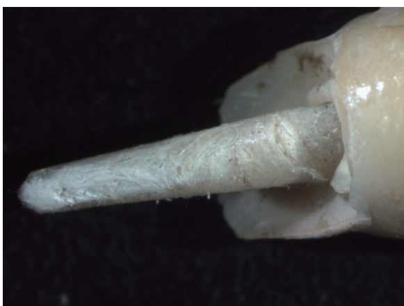
Fig. 6. Failure of post dislodgement.