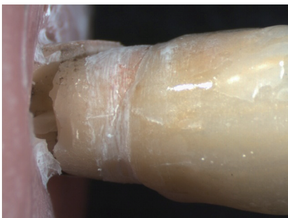
Fig. 5. Failure of root fracture.