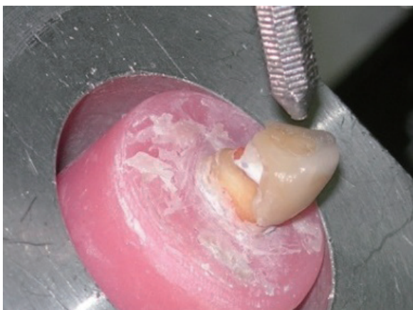
Fig. 2. Fracture of the all-ceramic crown.