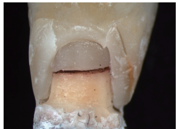
Fig. 3. Failure of all-ceramic crown fracture.