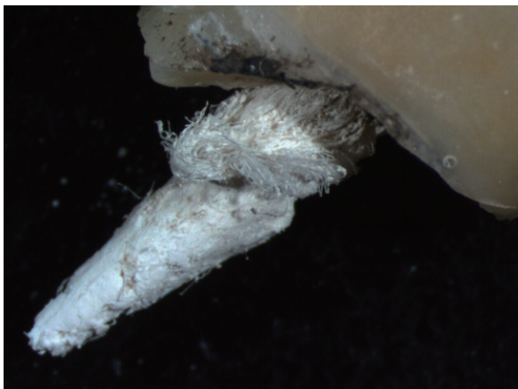
Fig. 4. Failure of post fracture.