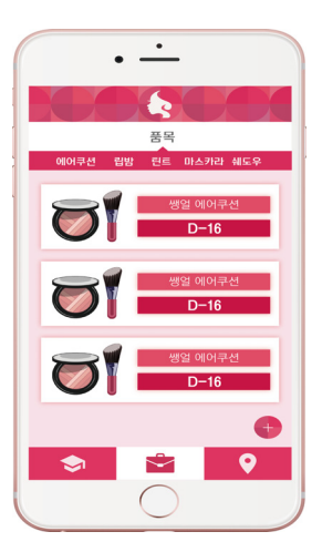
[Fig. 2] Cosmetics App List UI Design

As in the picture, UIs for the icon search window and icon alarm window have been designed. Worrying that users might find it difficult to find a product if there are too many products registered, it is designed to search for the product name set by users when they register the product for the first time.