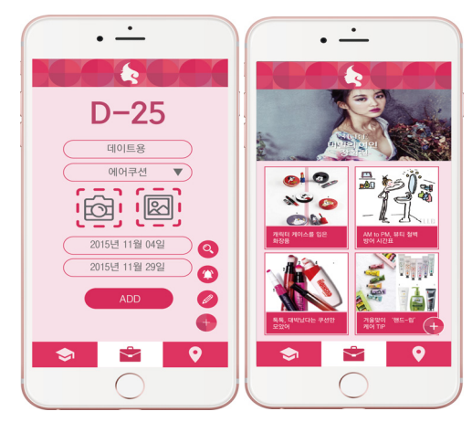
[Fig. 3] Cosmetics App Register UI Design