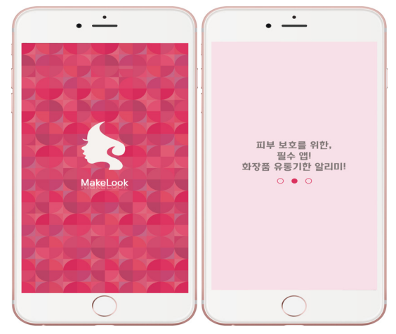
[Fig. 1] Cosmetics App Main UI Design

this paper are comprised of the intro, menus, and details on functions as follows so that users can easily understand.