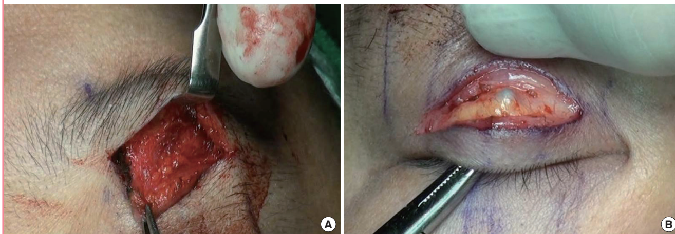
Fig. 2. Intraoperative photograph after tunneling of the muscle flap

(A) The frontalis muscle flap was elevated to be as thick as possible. (B) The soft tissue on the tarsal plate was removed as much as possible.