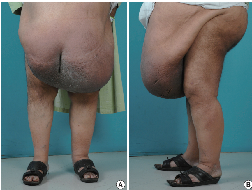
Fig. 1. (A, B) Preoperative photograph of a 54-year-old male with massive localized lymphedema at the abdomen.

A 54-year-old morbidly obese male was admitted to our hospital with a giant mass involving the lower abdomen and mons pubis. The mass had started in the abdominal area and gradually increased in size over six years and later obscured his penis and scrotum (Fig. 1). The patient's medical history included morbid obesity, hypertension, diabetes, gout, and a renal stone. There was no history of trauma or surgery in the abdominal area. On physical examination, the patient was morbidly obese, with a weight of 130 kg, a height of 165 cm, and a body mass index of 47.75 kg/m 2 . The mass extended to the left knee when the patient stood at his full height. The skin overlying the mass had a 'peau d'orange' appearance. A CT scan of the patient showed skin and subcutaneous tissue thickening suggestive of lymphedema and a 3.3 cm-diameter umbilical mesenteric fat hernia. We decided to combine abdominoplasty with liposuction and repair the abdominal wall. The incision line was designated along the bottom line of the mass lesion and the umbilicus. After the skin incision, dissection was performed down to the level of the rectus fascia, and further to the intersecting boundary of the xiphoid process and bilateral costal margins. This wide undermining allowed the greatest amount of inferior advancement of the abdominal flap (Fig. 2A). Once the abdominal flap was elevated, tumescent solution (normal saline 500 mL+2% lidocaine 12.5 mL+0.1%