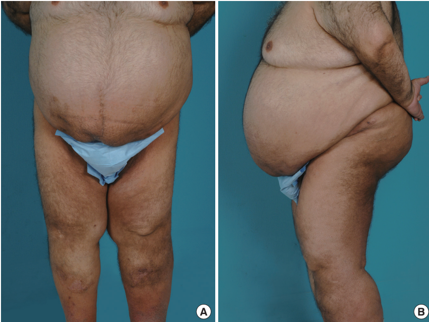
Fig. 3. (A, B) Three-month postoperative images showing no evidence of recurrence.

of MLL in the future. In this report, a rare case of MLL was successfully treated by surgical resection. Although there were minor complications such as wound dehiscence and seroma, there were no major complications or recurrence for a period of three months after surgery.