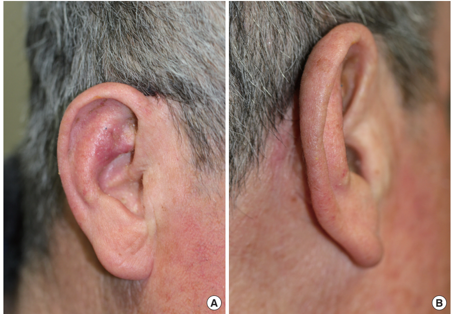
Fig. 4. Five-month postoperative follow-up views. (A, B) Anterior and posterior aspects of the ear.

Our technique can be summarized as follows. First, we approached the postauricular donor site proximally to the sulcus in the medial direction rather than in same region as the defect. Thus, we were able to obtain a sufficient amount of postauricular skin, even in patients with defects of the outer edge of the ear, such as the antihelix or scapha.