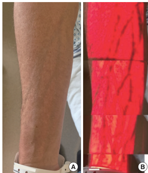
Fig. 1. (A, B) Hand-held vein visualization device, (AccuVein) uses a red laser and infrared laser to illuminate basilic and cephalic venous vasculature for the forearm.

The AccuVein was used on ten patients. In eight patients at least one SIEV was identified preoperatively in all patients and there was 100% positive and negative correlation of preoperative markings with intraoperative exploration (Fig. 3), and all veins were able to be identified intraoperatively. In the other two patients had abdominal striae that interfered with venous imaging and abdominal veins were not able to be visualized. In two patients preoperative vein mapping changed the flap design: the inferior incision was lowered to explore the vein before it bifurcates to include a larger caliber vessel in the flap for flap drainage or when patients were possible SIEA flap candidates. There were no AccuVein related complications and no false