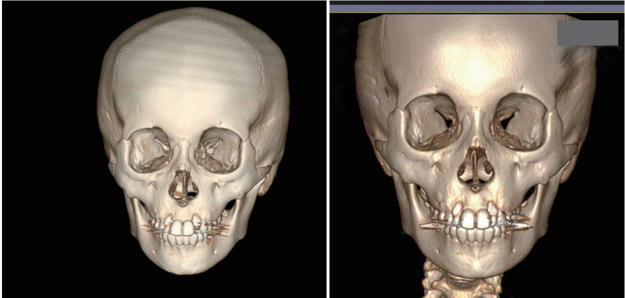
Fig. 2. Three-dimensional-computed tomography (3D CT) reconstructed model. It is difficult to use one 3D CT reconstructed image as a reference for another due to the different absolute values generated by differing conditions such as display field of view, tilt, and window, as in the two images shown here.

In reality, absolute values differ even for a single patient whose CT scans were obtained under differing conditions (Fig. 2). However, if the various conditions of CT scans are unified, not only the measurement of the absolute values but also interpersonal comparison is possible. The following factors are needed: First, the physical values for the CT scans must be the same across all scans. These include the field of view, angle value, z-axis value, monitor resolution, and image magnification. With these conditions held constant, images can be reconstructed in the display window on the screen and measurements can be screen-captured and sent to the PACS. In such contexts, the linear and angular measurements are representative of the physical values.