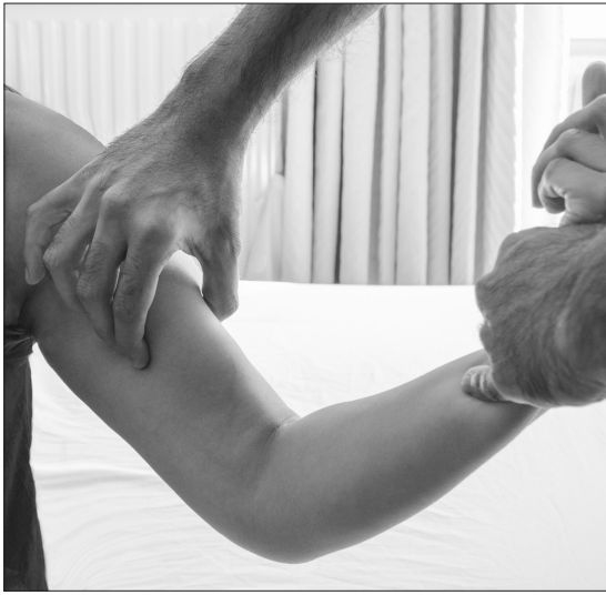
Fig. 1. With the patient's forearm supinated and flexed to 90 degrees the examiner gently grabs the biceps muscle belly and attempts to translate it medially and laterally.