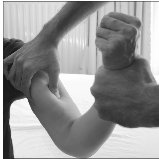
Fig. 2. This demonstrates the translation (medially in this case) which will occur with a relaxed biceps. This degree of translation will not be present in resisted flexion with an intact distal biceps tendon.