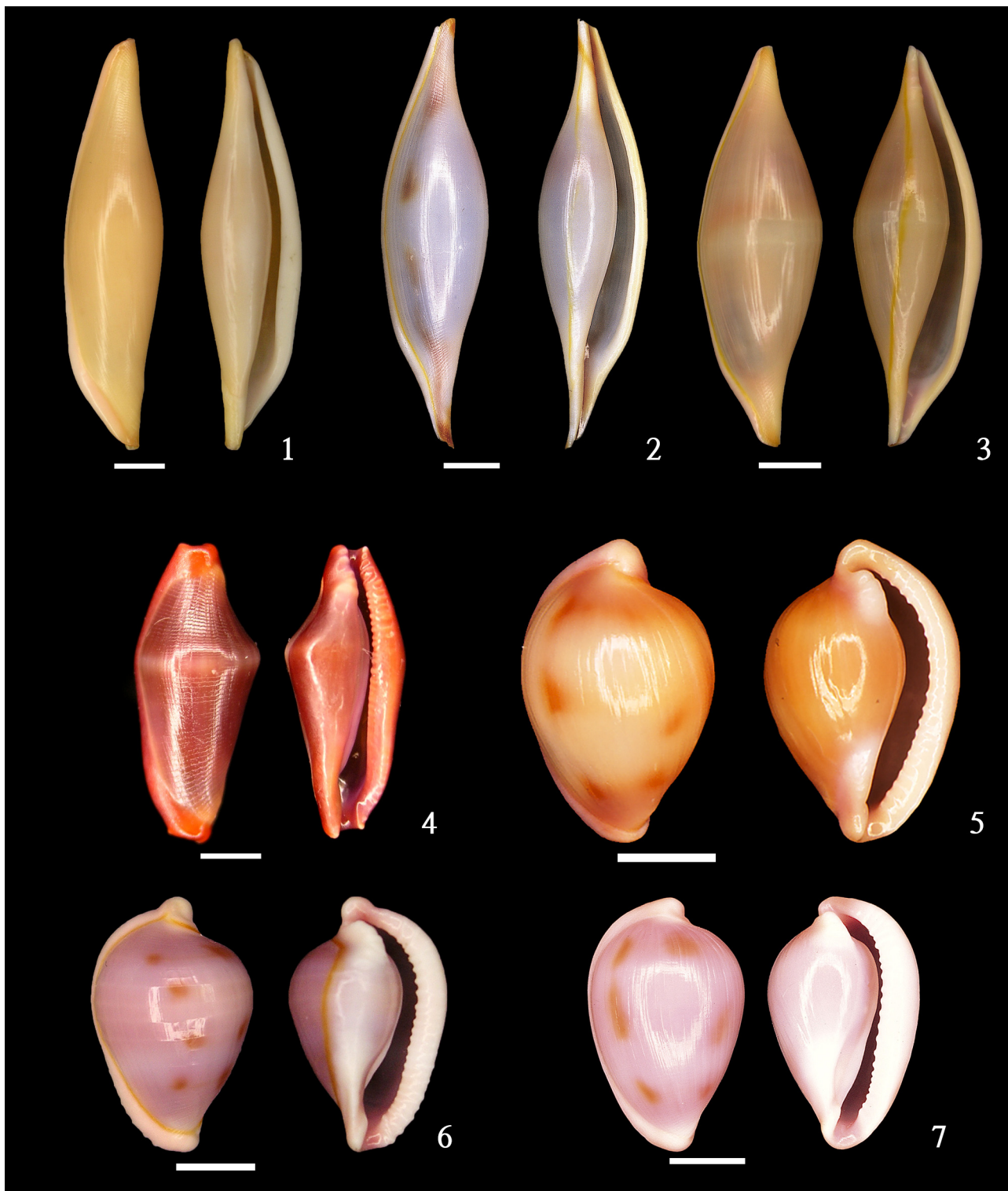
Fig. 1. Pellasmimnia angasi (Reeve, 1865). Scale: 3 mm. Fig. 2. Phenacovolva pseudogracilis Cate & Azuma, 1973. Scale: 4 mm. Fig. 3. Phenacovolva rehderi Cate, 1973. Scale: 5 mm. Fig. 4. Crenavolva leopardus Fehse, 2002. Scale: 2 mm. Fig. 5. Diminovula coroniola (Cate, 1973). Scale: 5 mm. Fig. 6. Diminovula stigma (Cate, 1978). Scale: 4 mm. Fig. 7. Diminovula whitworthi Cate, 1973. Scale: 4 mm.