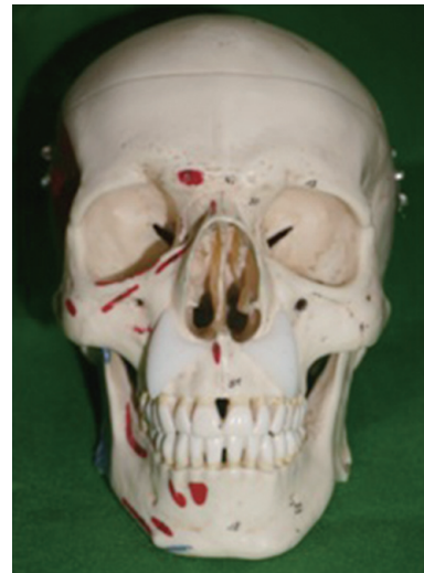
Fig. 1. The silicone implants are designed to augment both paranasal areas.

The sulcus incision was closed with 4-0 vicryl suture. Compressive tape dressing was applied to prevent swelling and hematoma formation. Postoperative regimen included prophylactic antibiotics and gargling. Compressive dressing was maintained for 5 days, and stitches were removed from 8 to 10 days after operation.