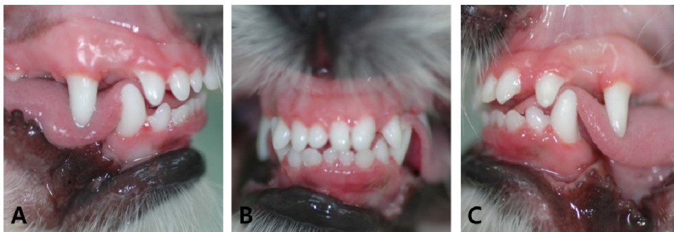
Fig 6. Photographs of the third patient after 8 weeks. (A) Right lateral view, (B) Frontal view, (C) Left lateral view. Compared Fig 5, the mandibular canine teeth were placed into a proper position and the maxillary incisor teeth overlap with the mandibular incisor teeth (scissors' bite).