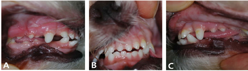
Fig 1. Photographs of the first patient before treatment. (A) Right lateral view. Tooth-to-tooth contact due to rostrverted mandibular canine teeth was observed. (B) Frontal view. Wry bite was observed. (C) Left lateral view. As in the right lateral view, there was tooth-to-tooth contact between the mandibular canine and the maxillary incisor teeth.