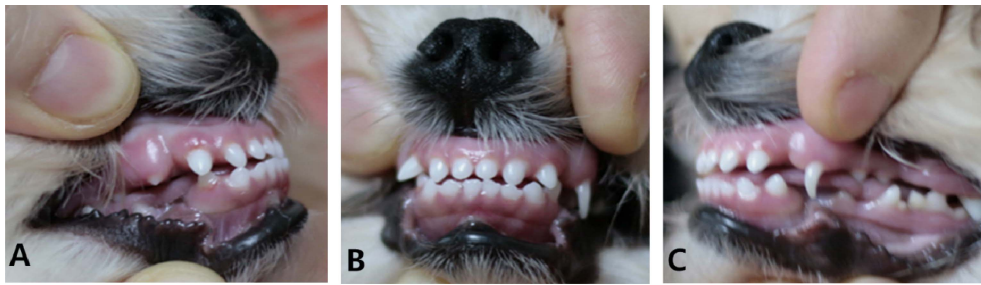
Fig 5. Photographs of the third patient before treatment. (A) Right lateral view. The right mandibular canine tooth was in contact with the right maxillary third incisor tooth. (B) Frontal view. A level bite was seen. The incisor teeth met edge on edge. (C) Left lateral view.