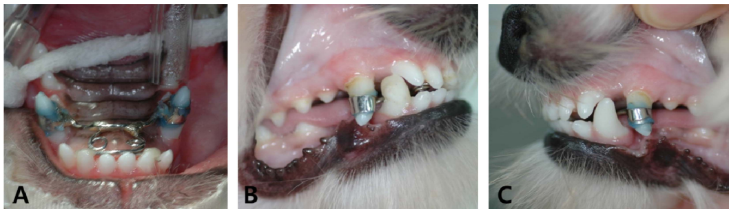
Fig 4. Photographs of the second patient after treatment. (A) Application of maxillary arch wire with finger spring in the second patient. (B) Right lateral view of the patient after 8 weeks treatment, (C) Left lateral view of the patient after 8 weeks treatment. Compared to Fig 3, the patient had obtained a normal occlusion and could close the mouth. Moreover, the mandibular canine teeth were positioned into proper occlusion.