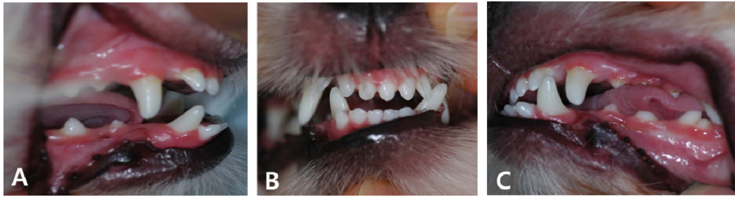
Fig 3. Photographs of the second patient before treatment. (A) Right lateral view. The mandibular canine was rostrally deviated. (B) Frontal view. Excessive “freeway space” and wry bite were observed. (C) Left lateral view. There was tooth-to-tooth contact between the mandibular canine and the maxillary incisor teeth.