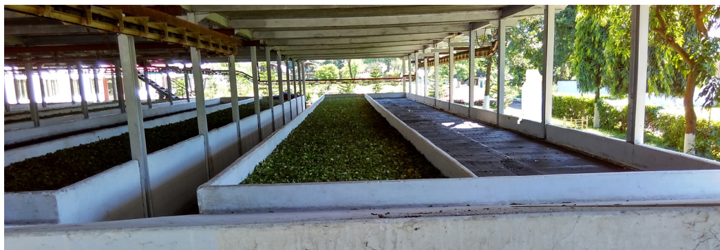
Figure 2. Open trough withering system.