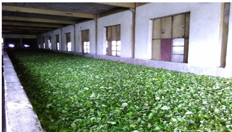
Figure 3. Enclosed trough withering system (Source: Koomber Tea Estate, Goodricke Group Limited, Silchar).