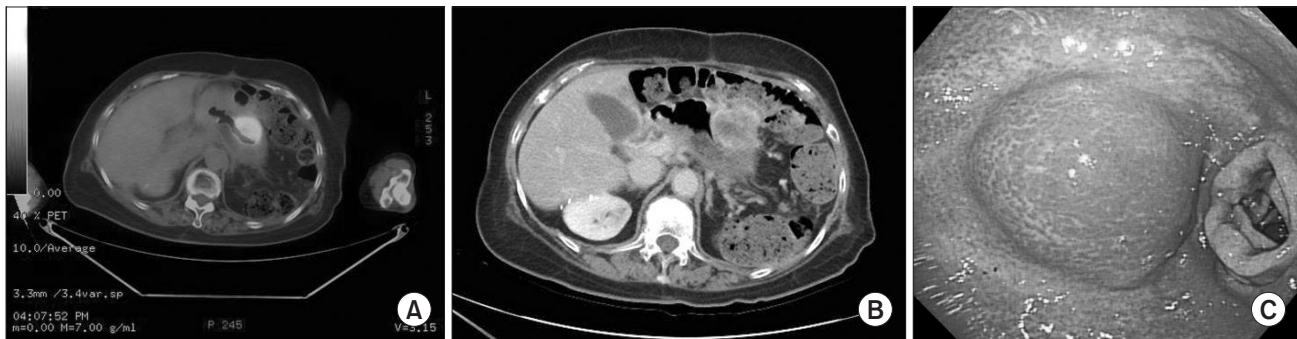
Fig. 3. Recurrence in the remnant stomach. (A) ^{18}\text{F} -fluorodeoxyglucose positron emission tomography with computed tomography shows a hypermetabolic mass in the remnant stomach. (B) An enhanced abdominal computed tomography demonstrates recurrent gastric cancer with invasion to the pancreas. (C) On esophagogastroduodenoscopy, a normal mucosal covered mass is visible at the proximal site of the anastomosis.