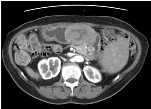
Fig. 1. Computed tomography scan of the metastatic tumor. The computed tomography scan shows a 6.5×6.0-cm mass compressing the gastric antrum and body, suggestive of a metastatic node of the omentum.

The patient underwent explorative laparotomy. A 7×5-cm isolated mass on the greater curvature of the stomach and multiple enlarged perigastric, perihepatic, celiac, and para-aortic lymph nodes were found. A distal gastrectomy with a Billroth