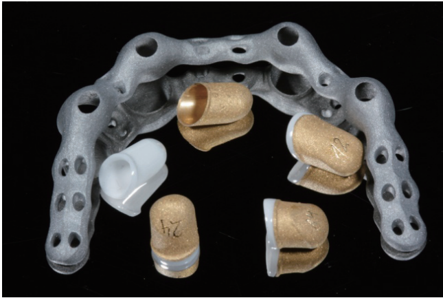
Fig. 1. Components of the CGDC restoration: milled and polished primary zirconia crowns, electroplated secondary crowns, and cast framework.

fracture rates and therefore was later replaced with yttria-stabilized zirconia polycrystals (Y-TZP or zirconia). 15 Subsequently, conical crowns with zirconia primary crowns and electroplated copings as female parts have been evaluated in several in vitro studies. 16-18 The CGDCs demonstrated clinically acceptable mean retentive forces and reduced excursive retentive force development compared with cast double crown systems. 17,18 The retentive force was influenced by the abutment height and the taper. It was concluded that zirconia primary crowns with a sufficient height and 2° taper can serve as an alternative to gold alloy primary crowns. 16