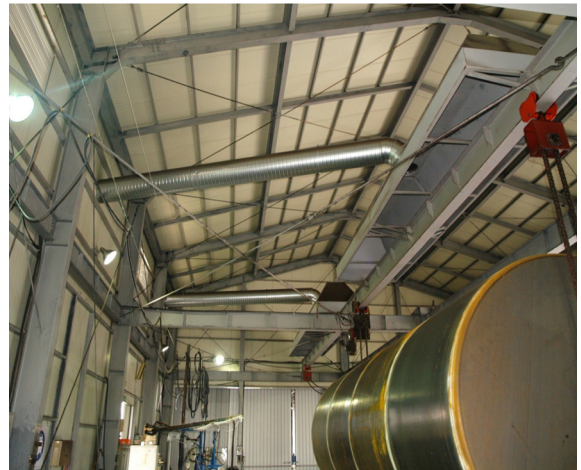
Figure 1. Photograph of local exhaustive ventilation in the lamination workplace

There were a total of 5 workers including one sprayer who conducted coating by spraying the mixture of FRP, UPR, hardner and toner, three helpers engaged in rolling to prevent bubble formation during coating and for even lamination of the surface, and one inspector who undertook the examination of the final product quality. In terms of job characteristics of 5 workers, a sprayer conducted coating by spraying with the mixture of FRP, UPR, hardner and toner on a tank, helper 1 and helper 2 did rolling operation next to and on the opposite side of a sprayer, respectively around the tank, and helper 3 was assisting the helper 1 or helper 2.