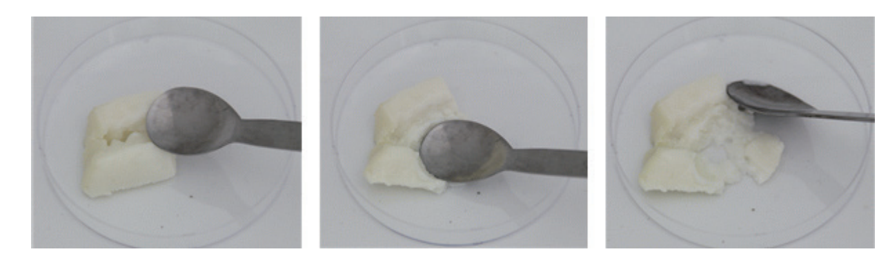
Fig. 3. Appearance of jumbo squid softened by bromelain injection method with a spoon by hand.

centration but shape was completely retained (Fig. 3). Squid treated with Brom at 0.5% (w/v) can thus be consumed by subjects with mastication and swallowing problems (the cut-off hardness is 5.8 \times 10^4 N/m<sup>2</sup>; Fujisaki, 2012).