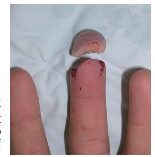
Fig. 1. A preoperative clinical photograph. The preoperative clinical photograph shows volar oblique amputation in zone I.